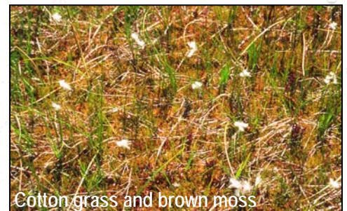
Cotton grass and brown moss