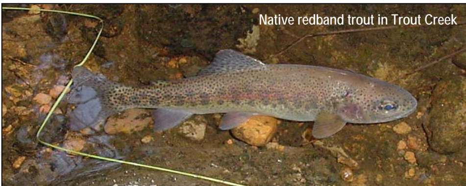
Native redband trout in Trout Creek

In an effort to reverse the effects of historic ditching, the Upper Deschutes Watershed Council and the USFS Sisters Ranger District have partnered to implement a two-year project to restore site hydrology, improve downstream habitat conditions for redband trout, control invasive weeds and enhance available habitat for wildlife and rare wetland plants (see photos).